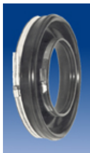
PSI Model "S" End Seal

Material:..... EPDM 60 under 12" ..... SBR over 12" Thickness:..... 1/8" Color:.....(Black) Temperature:..... 250°F ..... 180°F Hardware:.....304 Stainless Steel Bands w/worm screws Sizing:.....Consult Factory