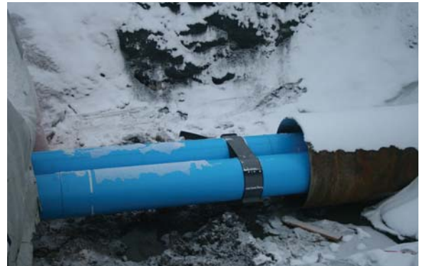
Model C12GN2 used on (2) 24" C-905 Chilled Water Lines going through a 60" casing.