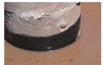
Riser-Wrap® used to rehab. an existing manhole submerged in runoff water.

For Extreme Applications: Consider Riser-Wrap(R) heat shrink sleeves.